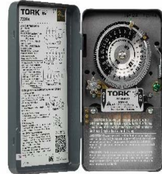
7209A 24Hr Multi Voltage Skip a Day Mechanical Time Switch