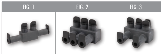
Figure varies by number of wire ports.