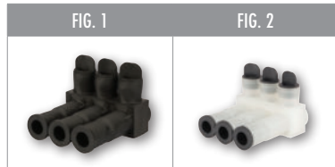
Figure varies by number of wire ports.