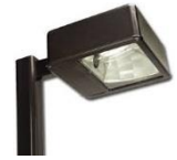
Shoe Box Parking