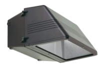
Cut-Off Wall Pack