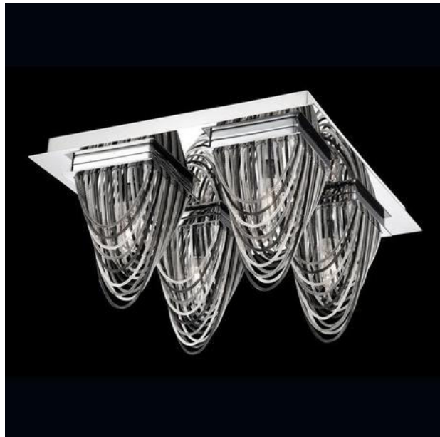
3 tone draped metal chains with chrome accent