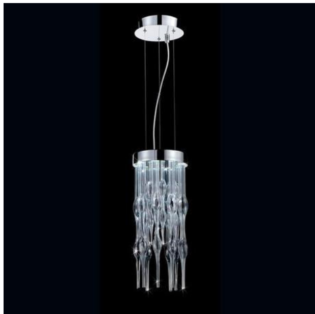
Organic drops of clear blown glass suspend from polished chrome fittings