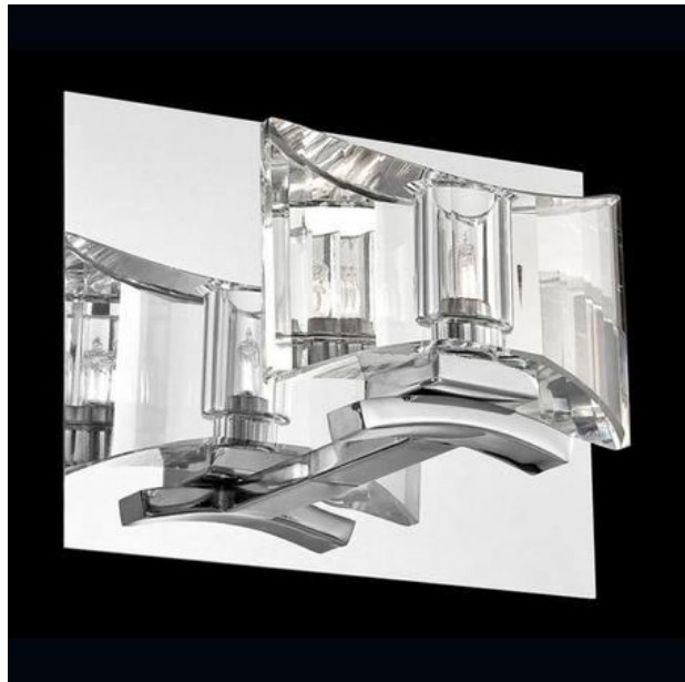
Clear crystal glass with chrome accent