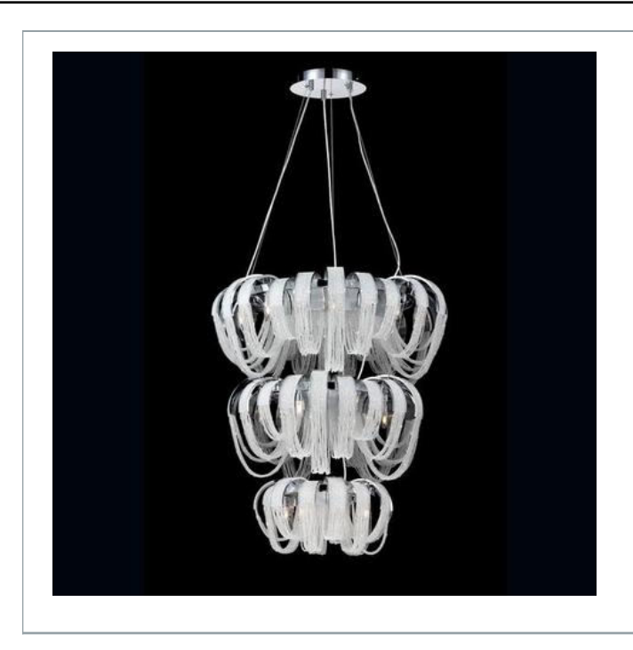
Draped rings of crystal beading layered in curved polished chrome tracks