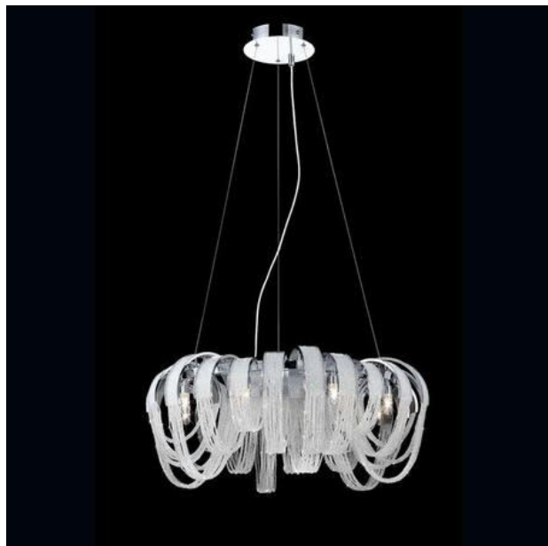
Draped rings of crystal beading layered in curved polished chrome tracks