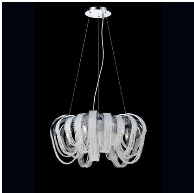
Draped rings of crystal beading layered in curved polished chrome tracks