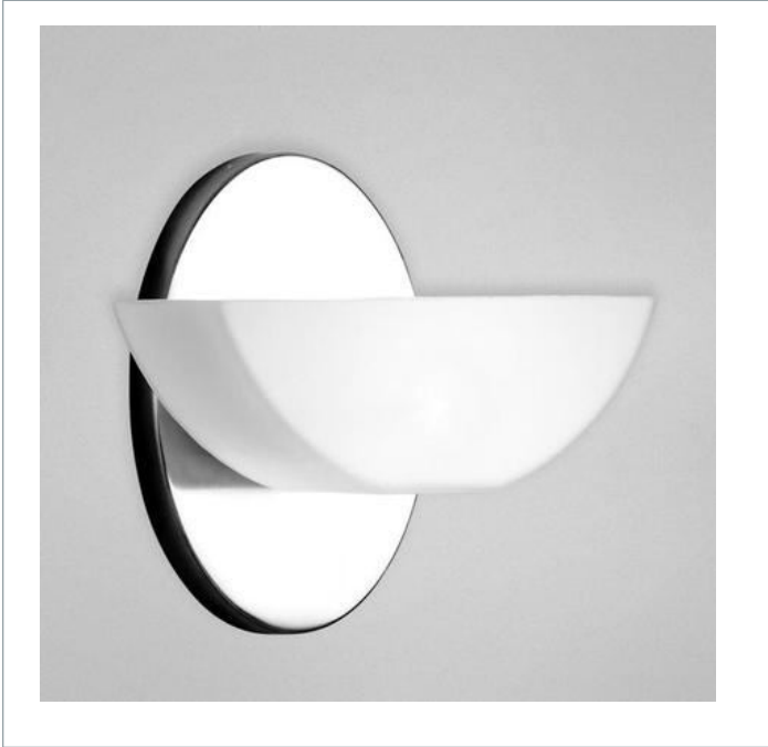
Crescent shaped opal white glass is set onto a simple satin nickel or chrome base.