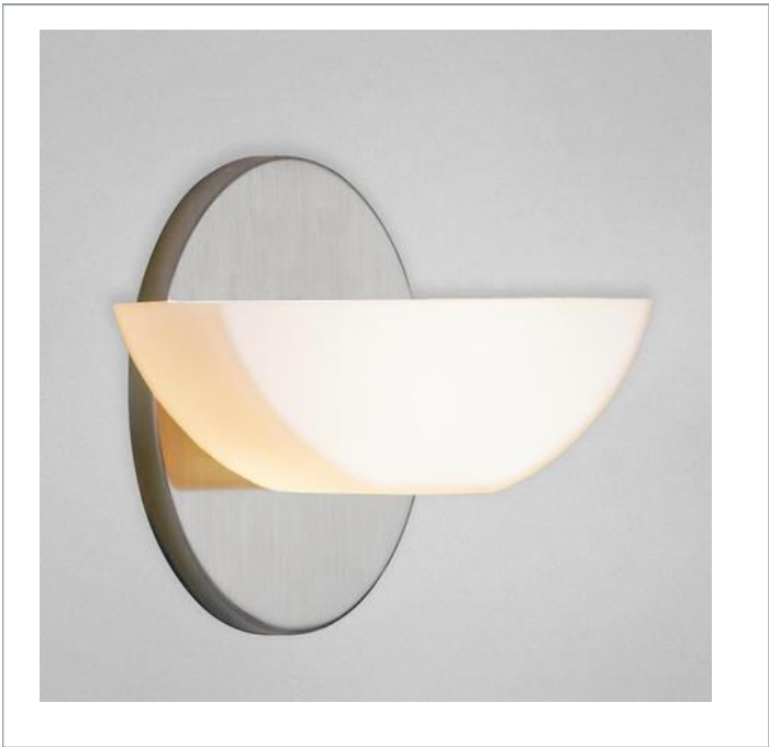
Crescent shaped opal white glass is set onto a simple satin nickel or chrome base.