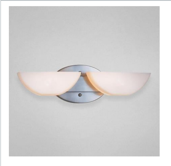
Crescent shaped opal white glass is set onto a simple satin nickel or chrome base.