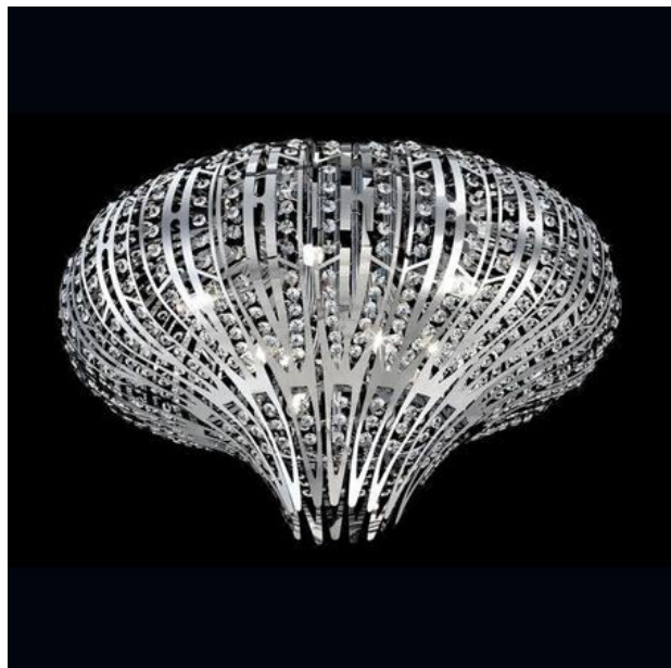
Polished laser cut chrome with inset crystal beading