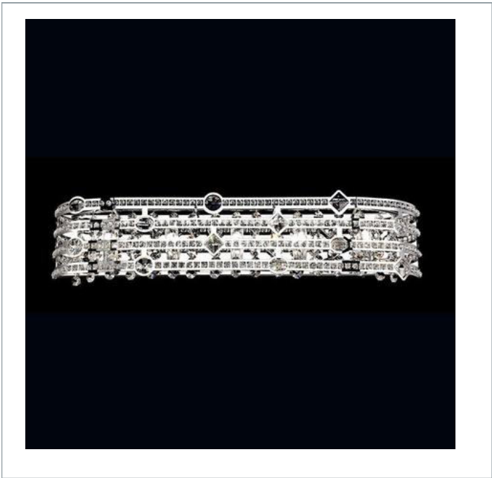
Laser cut chrome frame accented by crystal inlays and drops