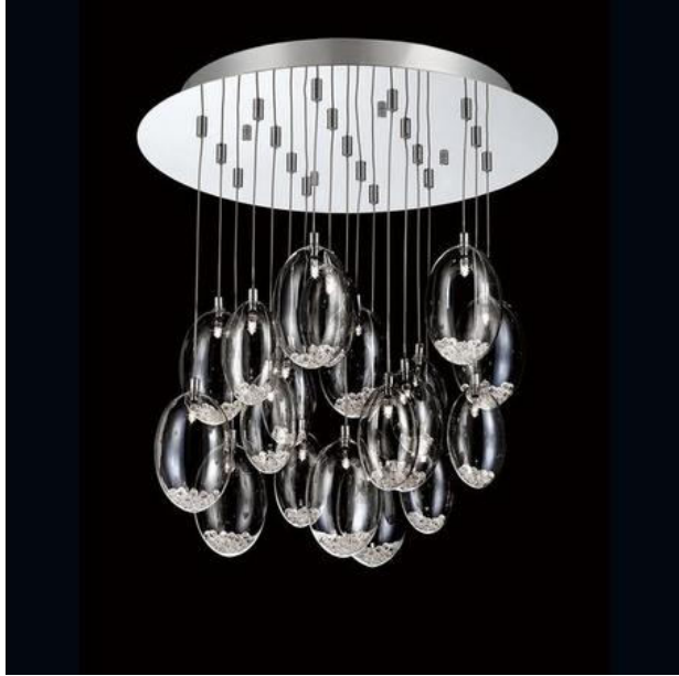
Clear crystal beads nesting inside hand blown amber glass with chrome accents