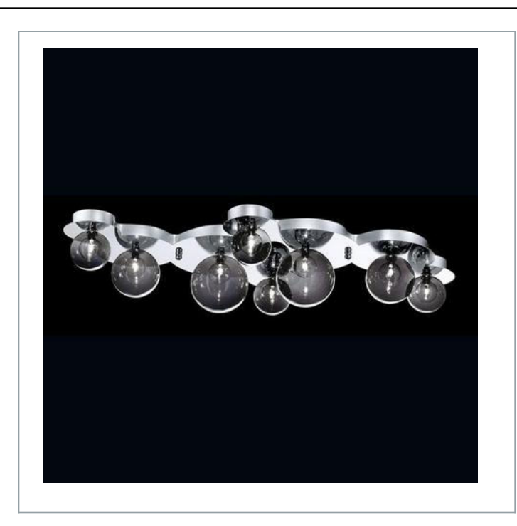
Exterior smoke and interior clear blown glasses with polished chrome accent