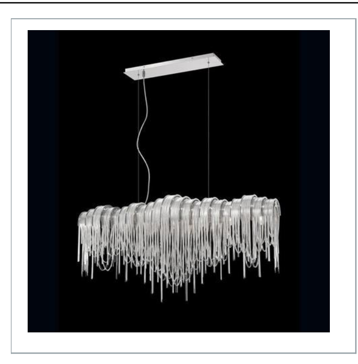
Draped nickel chain wrapped around curved nickel strips