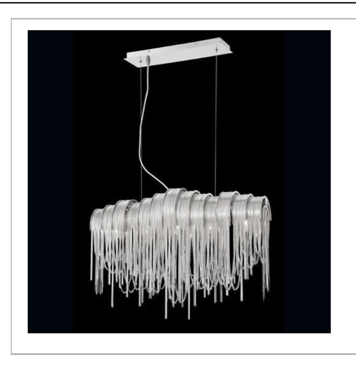
Draped nickel chain wrapped around curved nickel strips