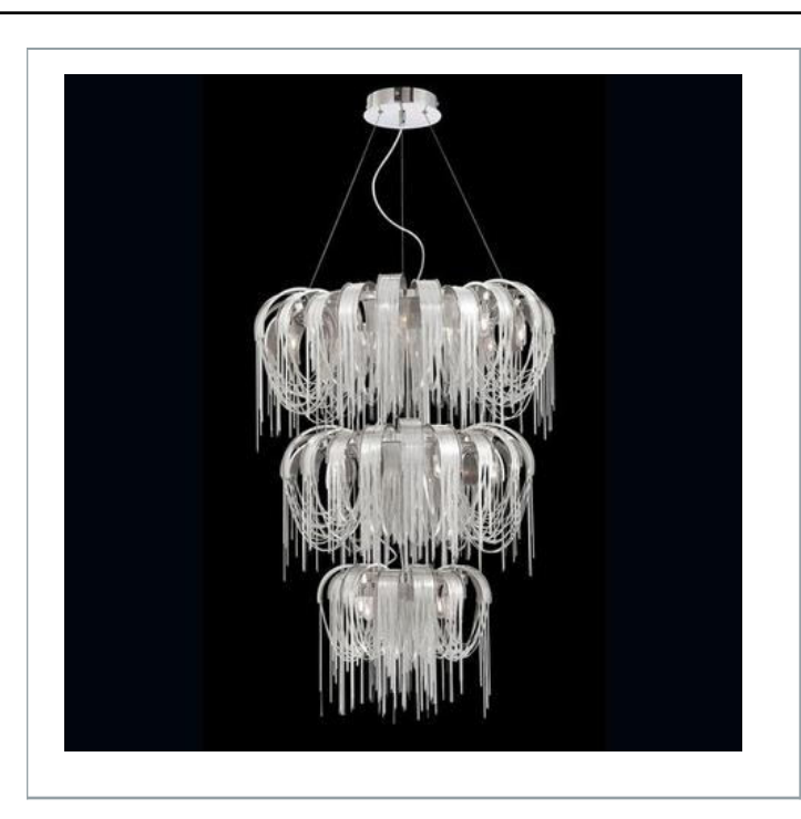
Draped nickel chain wrapped around curved nickel strips