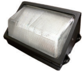
LED WALL PACK

Drivers can be accessed by unscrewing the glass frame and swinging it open