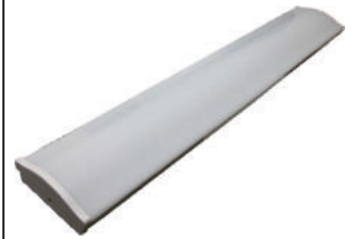
SILHOUETTE LED WRAPAROUND

mm | 1155(L) x 210(W) x 70(D) inch | 45.5"(L) x 8.3"(W) x 2.8"(D)