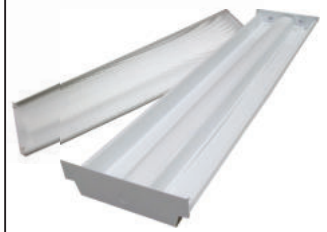
FLUORESCENT WRAPAROUND LUMINAIRE