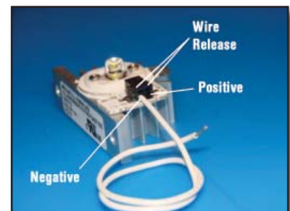
DLS LIGHT ENGINE TERMINAL WIRING PHOTO DIAGRAM