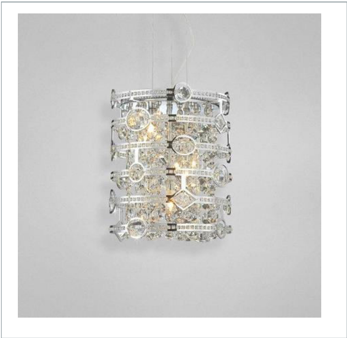
Intricate crystal in lays within the laser cut chrome give dimension to the lines of this collection.